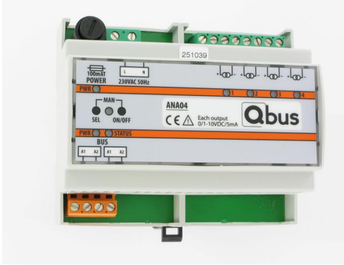
Figure 1 : Analog dimmer module ANA04