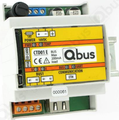
Figure 1 : Controller CTD01E